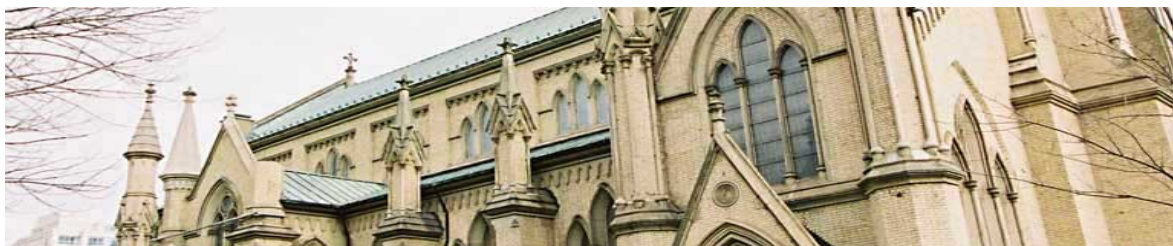
St. James Cathedral, Toronto, Diocese of Toronto.